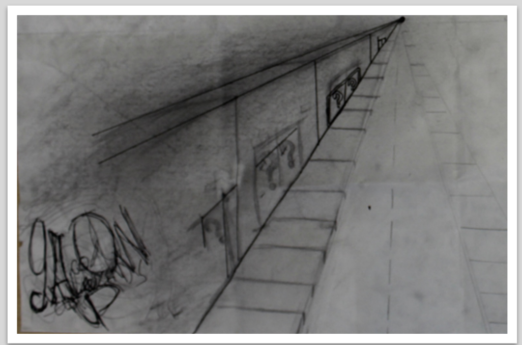
By Curtis T.

Misalignment in objectives: youth, care providers, social workers/system, researchers