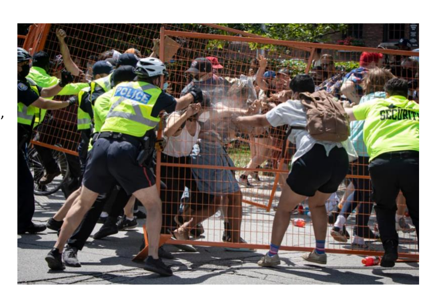
Figure 3: Demonstrators attempting to topple a fence are pepper-sprayed by Toronto police officers enforcing an eviction order in an encampment at Lamport Stadium.

Leading up the evictions, in spring 2021, the City created the Pathways Inside Program to provide additional shelter spaces. Following the announcement of the program, Notices of Trespass requiring encampment residents to vacate the parks by April 6, 2021, were issued at Moss Park, Alexandra Park, Trinity Bellwoods Park, and Lamport Stadium. The Notices of Trespass were not enforced, given the COVID-19 cases that were reported at the Esplanade, one of the shelters where residents were to be relocated. However, the