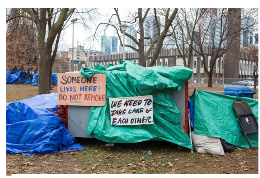
Figure 2: Encampment, downtown Toronto.

This is perhaps most evident in the case of the tiny shelters built by Khaleel Seivwright. In fall 2020, Khaleel Seivwright, a local carpenter, was building shelters to keep encampment residents safe from the cold. However, the City issued warnings and ordered Seivwright to discontinue the construction of the shelters. The City indicated that there were concerns over health and fire safety hazards before proceeding to remove and demolish the shelters. The City suggested encampment residents should instead go to the Better Living